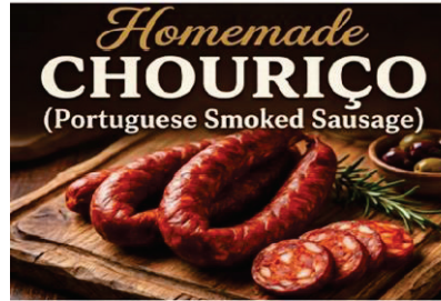
ONE DELICIOUS FLAVOR: MILD PRICE: $7.00 A PIECE