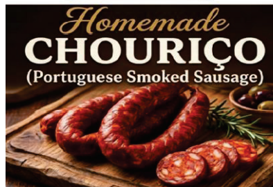
ONE DELICIOUS FLAVOR: MILD PRICE: $7.00 A PIECE