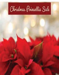
Christmas Poinsettias Sale

The Knights of Columbus will be taking orders for Poinsettias after all Masses on the weekends of November 6 and 7, and November 13 and 14. Those wishing to order Poinsettias can either complete the order form after Mass or take it home and return it the second weekend. Thank you for your support of the Knights of Columbus.