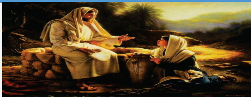
Gospel: John 4.5-42 – Jesus and the Samaritan Woman