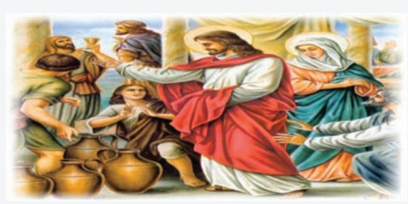
The Gospel of John 2. 1-12